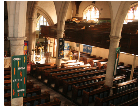
View of nave from galleries: Before reordering