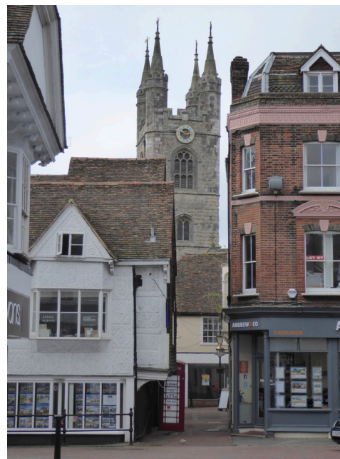
Left: view of church from the town centre

The church itself is one of six parish churches within Ashford Town Parish which extends to the surrounding areas of Great Chart, Kennington, Kingsnorth, Sevington, Shadoxhurst and Willesborough.