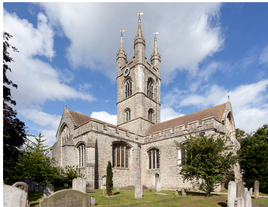
Below: view of church from the churchyard