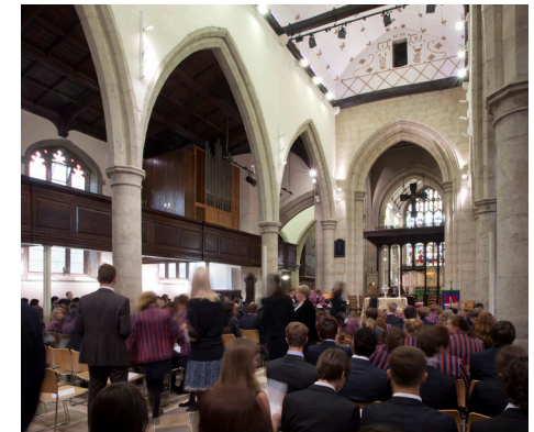
Above: School event in the nave