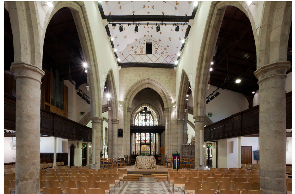
View of nave looking west towards the chancel after reordering