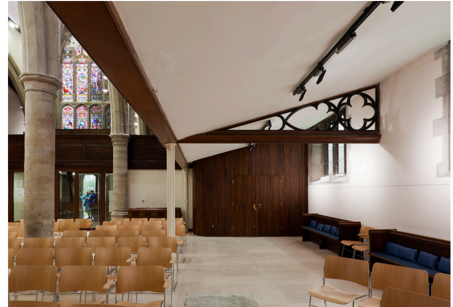
View of 'pod' at the west end of the north aisle