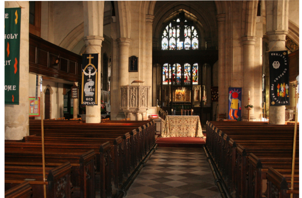
View of nave looking east towards the chancel before reordering

Architects: Lee Evans Partnership LLP Heating Design: Jupiter Heating Systems Ltd Archaeology: Canterbury Archaeological Trust Main Contractor: Farnrise (Builders) Ltd (now ceased trading) New seating: Alpha seating