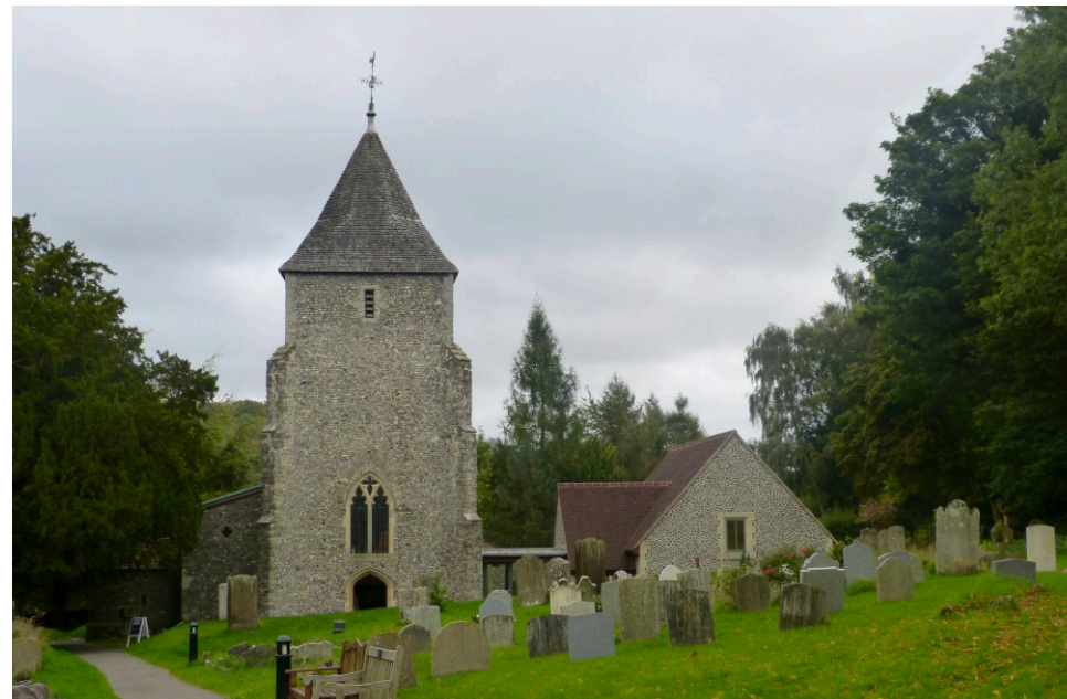
Above: View of church from the west with the extension to the right of the tower

All three parishes have limited community facilities, and although there is a village hall at Vigo, the primary school at Stansted was recently closed down.