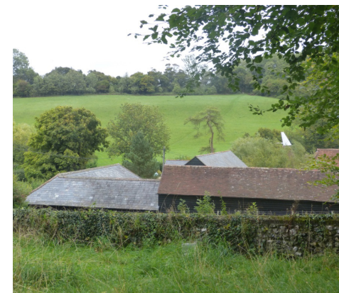
Above: View of rural setting to the north of the churchyard