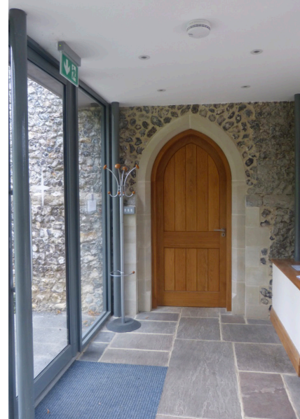
View inside link corridor looking towards the new tower door