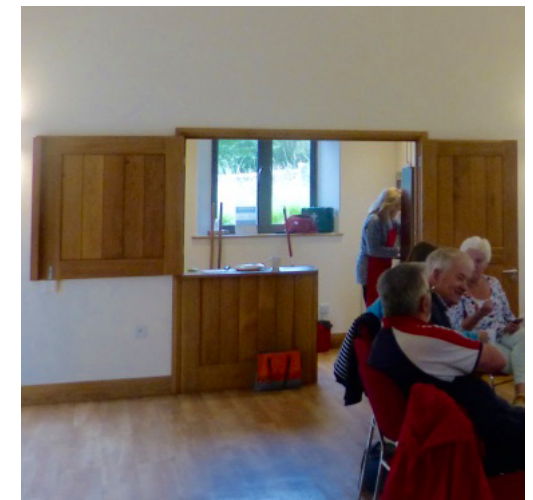
Doors to kitchenette & servery in open position