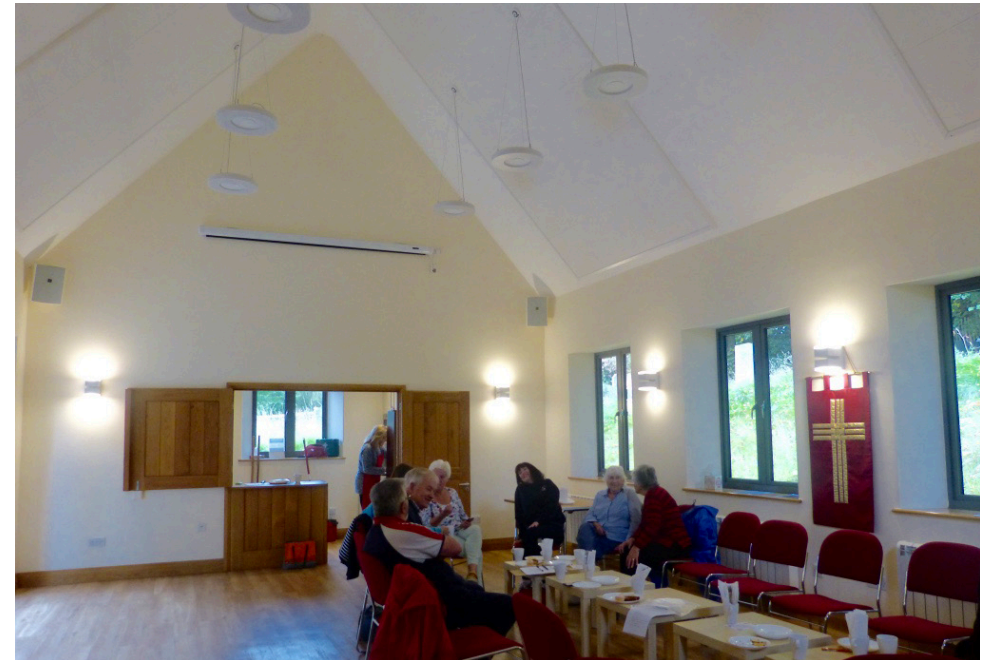
View of Cloisters Meeting Room

Involve the DAC and church buildings specialists at the earliest possible time, and keep them involved throughout, to avoid setbacks.