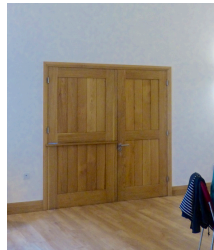
Doors to kitchenette & servery closed