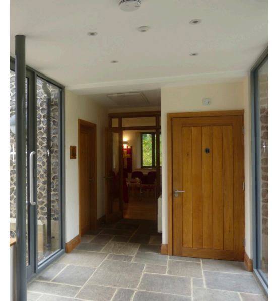
View inside link corridor looking towards the WCs and Cloisters Room