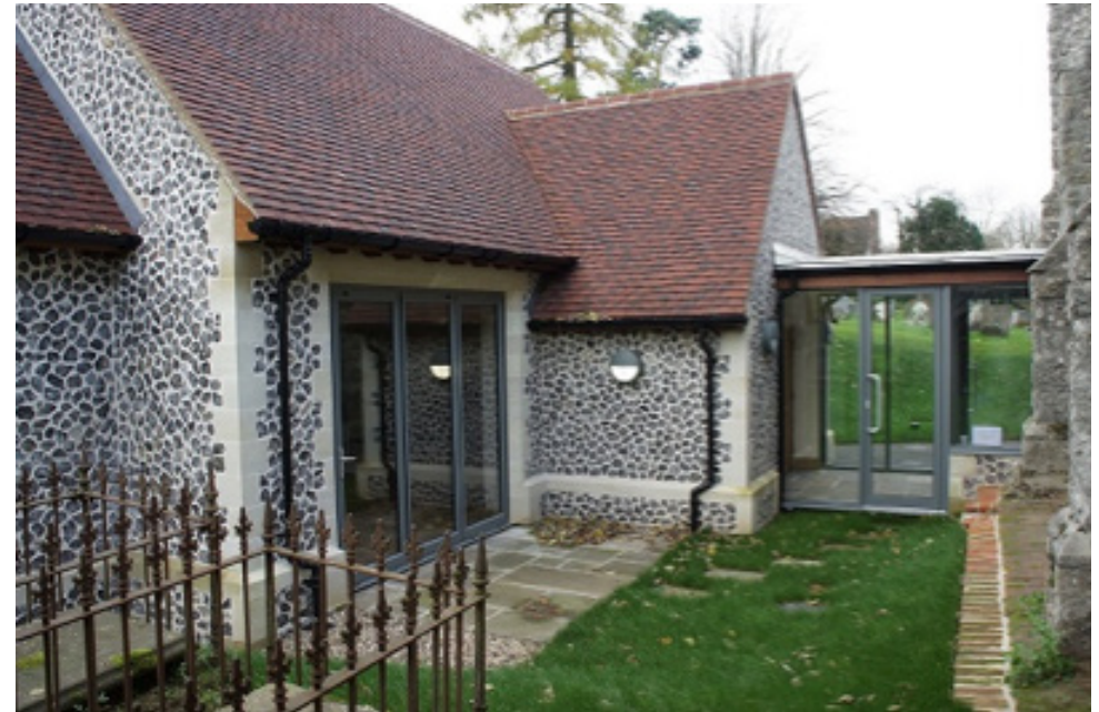
View of extension from the east showing the fully glazed link to the tower