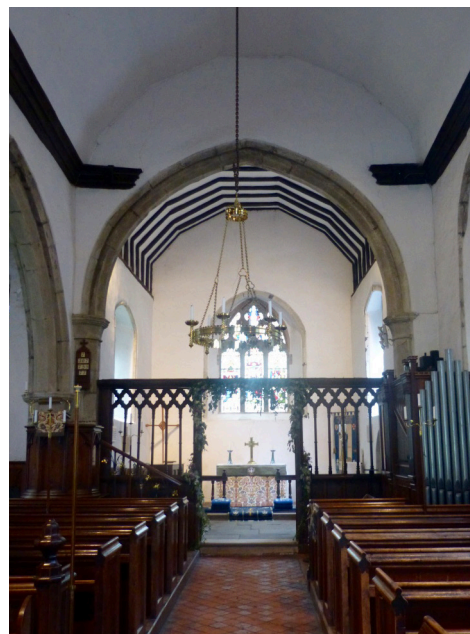
Above: View of chancel with rood screen