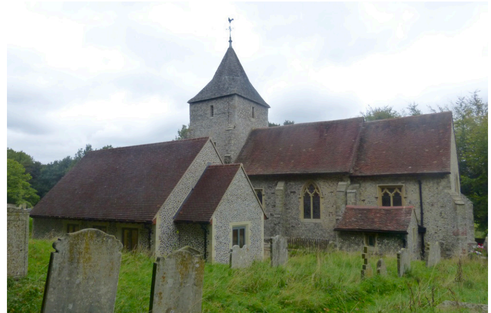
View of Cloisters extension from the south east